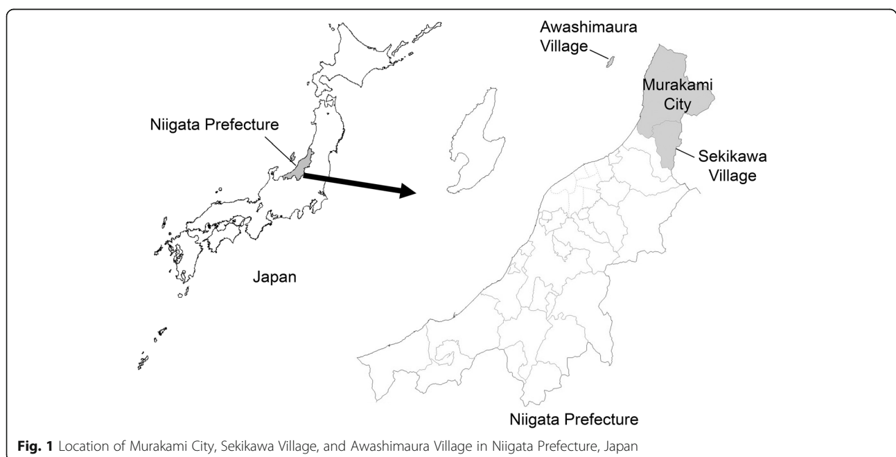
Fig. 1 Location of Murakami City, Sekikawa Village, and Awashimaura Village in Niigata Prefecture, Japan

The Murakami Cohort Study is a population-based study of age-related musculoskeletal diseases that targeted individuals aged between 40 and 74 years living in areas of northern Niigata Prefecture under the jurisdiction of the Murakami Public Health Centre (Murakami region). These areas include Sekikawa Village (3065 residents on April 1, 2011), Awashimaura Village (178 residents on January 1, 2011), and Murakami City (31,559 residents on January 1, 2012) (Fig. 1). All 34,802 residents in the Murakami region aged between 40 and 74 years were invited to participate in the study. Of these, 14,364 (41.3%)